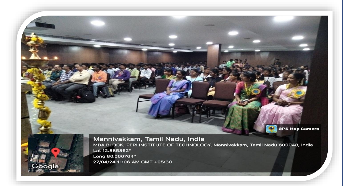
BF-9 SEMINAR HALL BETA BLOCK